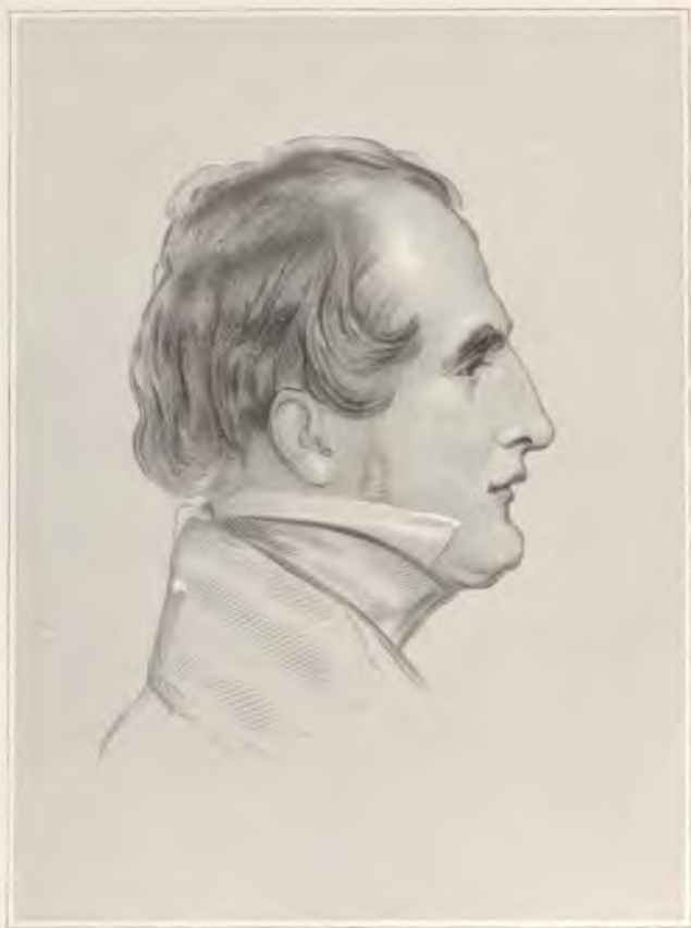
General Sir George Napier, K.C.B. at the age of 50